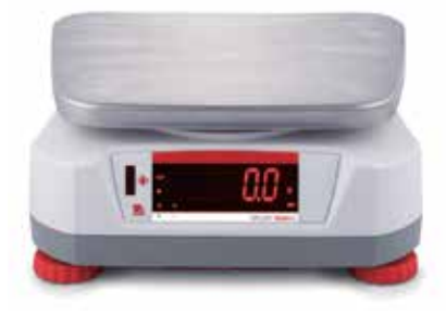
Rear Display with Integrated Touchless Sensor