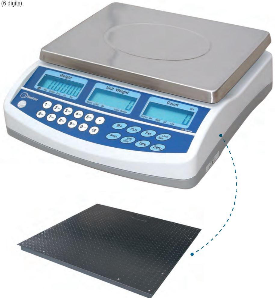
Connectable to auxiliary platform