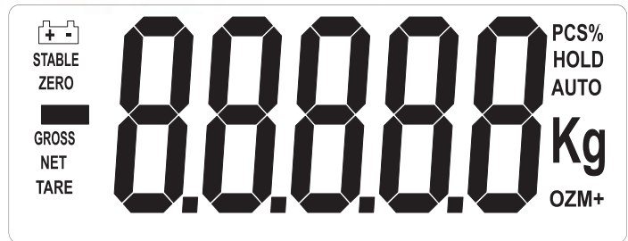
Visualization of the functions in the display