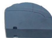
Power supply case fits under printer without increasing footprint size.