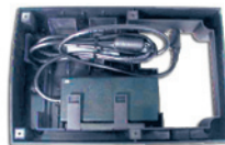
Optional power supply case secures cords under printer.

*To find out more about our line of Connect-It™ interfaces, talk to your Epson Sales Representative.